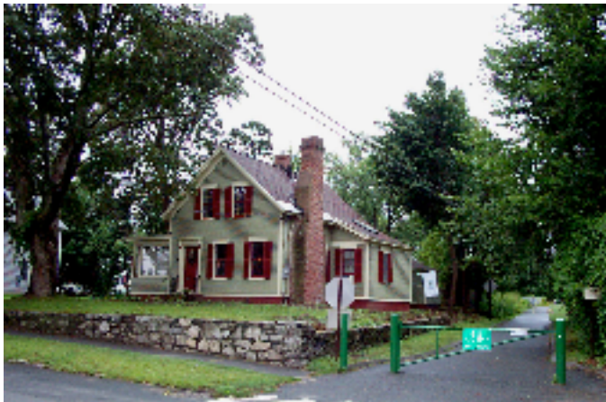
Living life along a rail trail in Florence, MA.